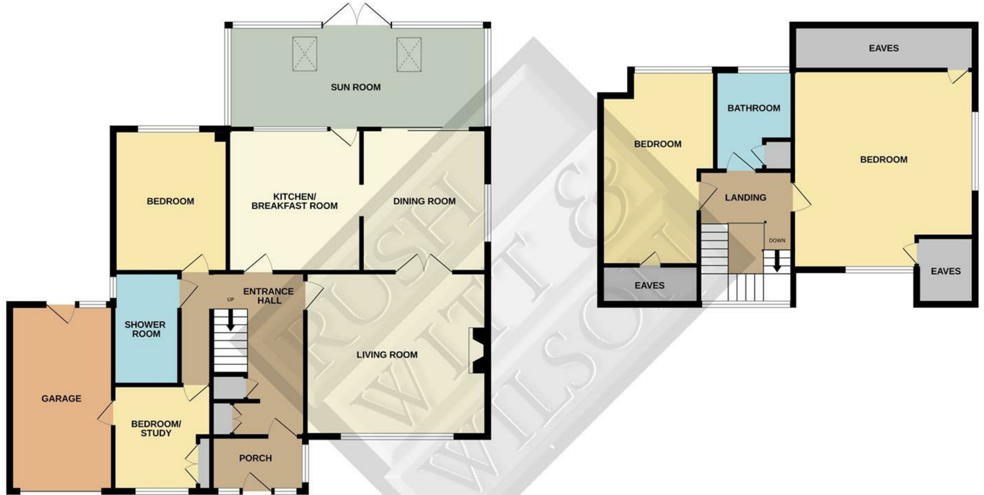
1ST FLOOR 691 sq.ft. (64.2 sq.m.) approx.

TOTAL FLOOR AREA : 1993 sq.ft. (185.2 sq.m.) approx.